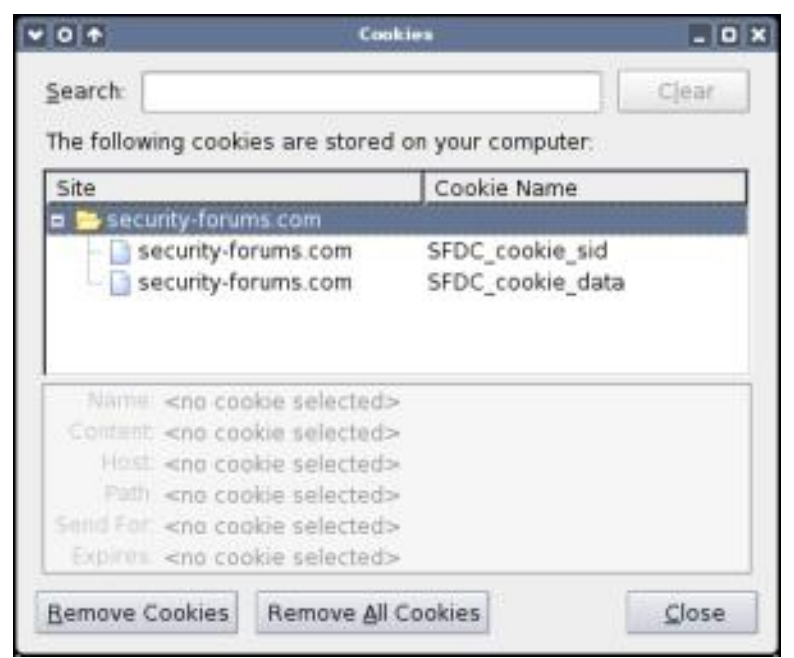
Cookies - PHP sessions make use of cookies to store the session identifier (SID). Cookie theft, and injecting attack data through a cookie, are problems which must be considered when developing web applications in PHP.

Passing session data in URLs is not recommended since it is possible to pass your session onto another user if you give them a link which contains your session ID, and the session ID data is more easily attackable than in a cookie. URL-based session tracking should be used only where cookies cannot.