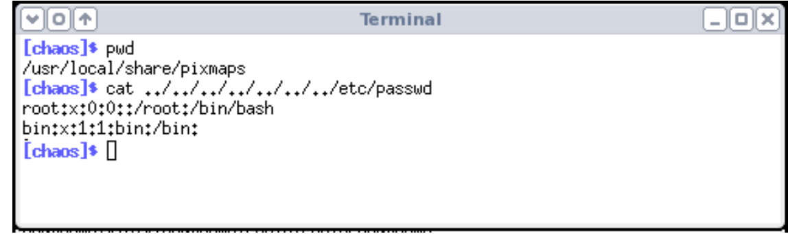
Directory Traversal – Interpretation of the special directory names . and .. can be used to alter the interpretation of a complete path.

This attack can occur anywhere user-supplied data (from a form field or uploaded filename, for example) is used in a filesystem operation. If a user specifies "../../../../../../etc/passwd" as form data, and your script appends that to a directory name to obtain user-specific files, this string could lead to the inclusion of the password file contents, instead of the intended file. More severe cases involve file operations such as moving and deleting, which allow an attacker to make arbitrary changes to your filesystem structure.